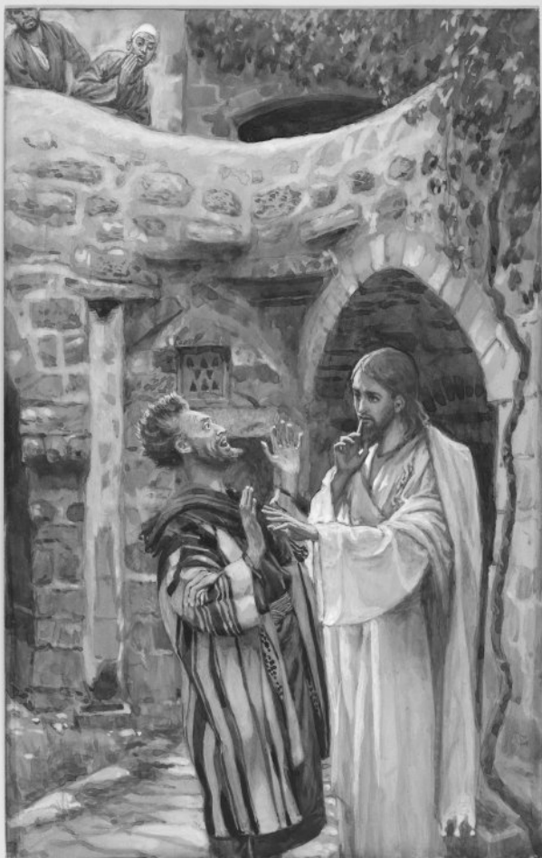
James Tissot (1836–1902), Jesus Heals a Mute Possessed Man

Twelfth Sunday after Trinity 26 August 2012